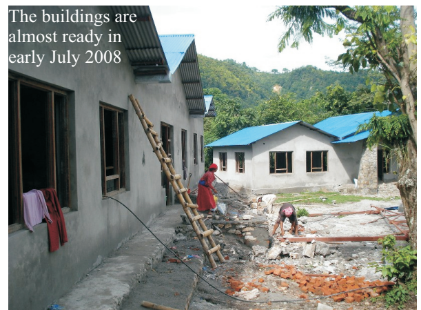
The buildings are almost ready in early July 2008